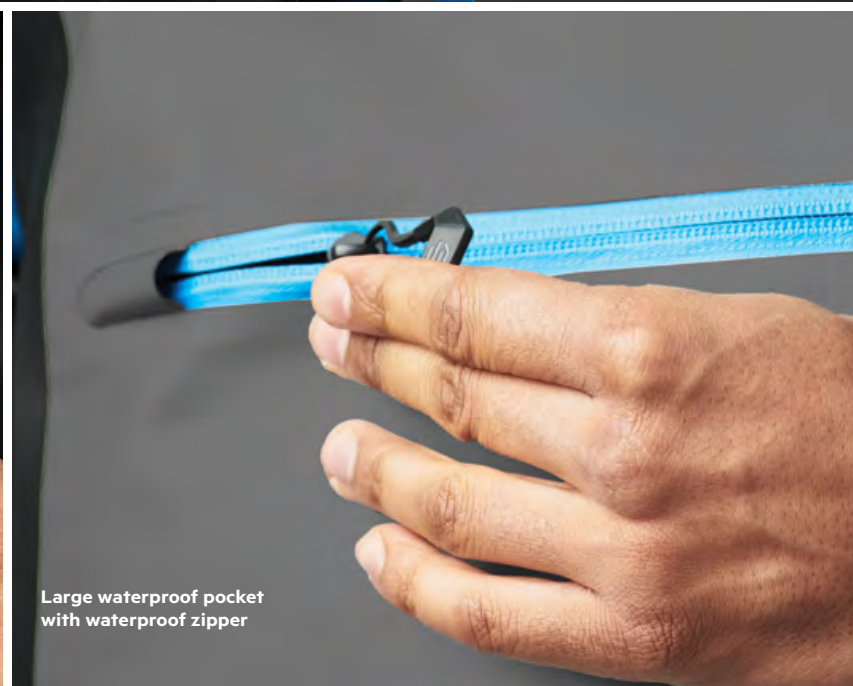
Large waterproof pocket with waterproof zipper